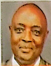
Hon. Basemuyi Vincent Karamukungi Minister of Agriculture, Animal Industry & Fisheries