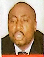
Hon. Karamukungi Christopher Minister of State for Agriculture