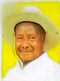
H.E. Yoweri Kagame Museveni President of the Republic of Uganda