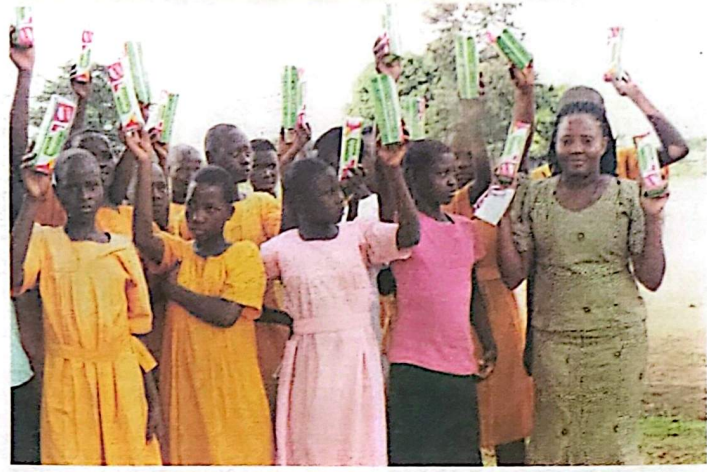
Group donations. KYEEYA Pupils of Kyeeya primary School receive sanitary pads from One Girl Bulogo Women's Group.