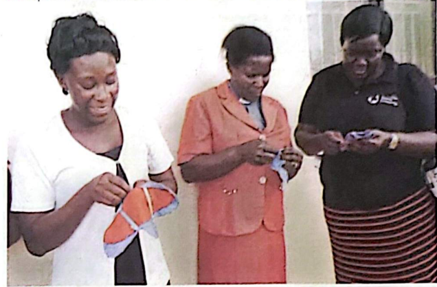
Make them. EAGY Aids Education Group for Youth mentors senior women teachers and church leaders to train girls on home made sanitary pads at Kamull Youth Center.