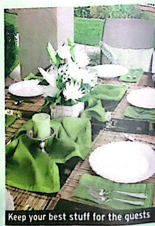
Keep your best stuff for the guests

cloth, use it. Make sure your wine glasses and cutlery are polished and shining. Put out any side plates, candles or other accessories before your guests arrive. Remember not to pile stuff high in the centre of the table, as this prevents easy conversation. Make sure you think of details such as a butter dish, salt and pepper shakers. This is so that you are not leaping up during the meal, because fine dining really is about the little details, as much as the food.