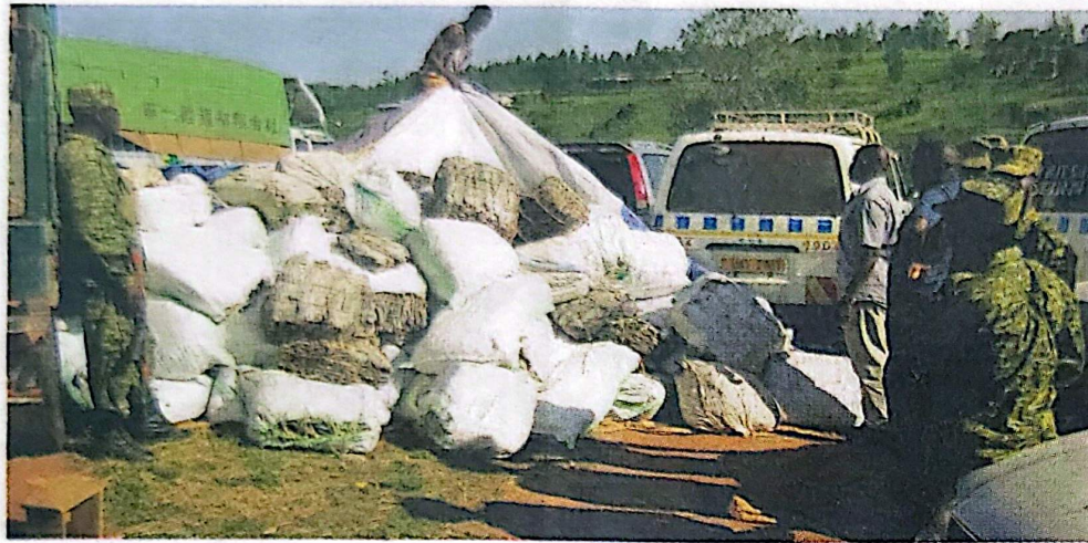
The fish which was impounded at Panyol in west Nile.

An official from the fish enforcement unit in Bunagana, Kisoro district, said the hunters kill the monkeys and