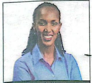
Uganda's share in its oil and gas - P26