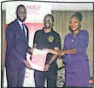
Uganda Scores 60% in Africa Mining Vision assessment - P25