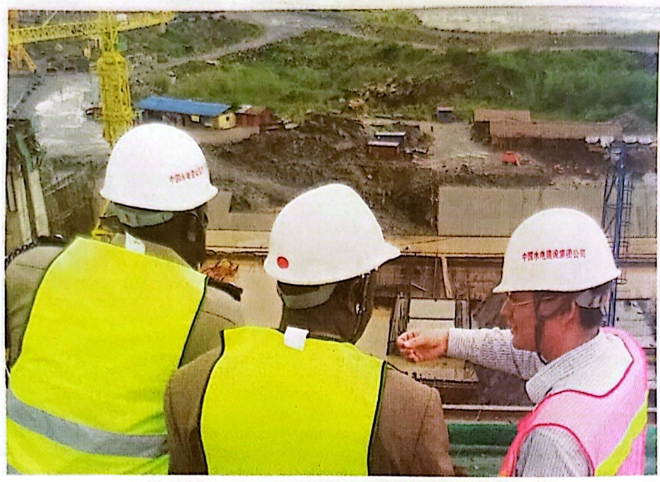
Infrastructure. A Chinese engineer shows a view of the Karuma Hydro Power Dam to officials last year.