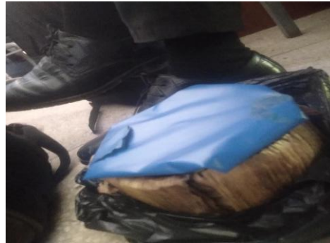
Figure 4.1: showing the design of a bio box

the figure above shows a complete set up of a bio box sample which was fabricated using the locally available resources : cassava starch, banana fibers, paper pulp, glycerol and distilled water which underwent all the processes of fabrication and up to the completion stage which made me to get all the courage to test is in all the processes and it was able to present the high level of eco friendly to the environment and high durability to the ordinary plastics which are not durable and it can with stand heat compared to the ordinary plastics and other bio boxes which were produced in the previous years