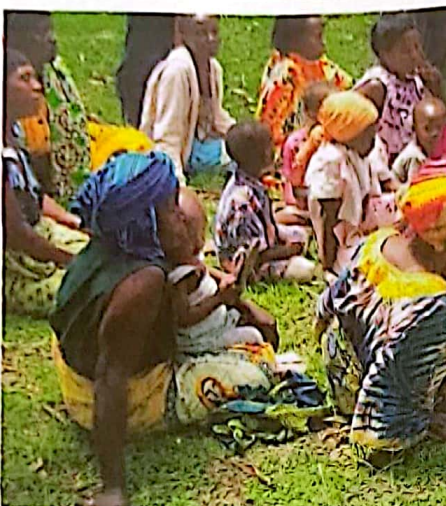
Affected residents gather to explain their ordeal. They have asked the land probe team to intervene