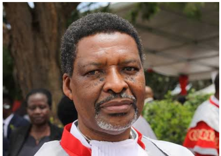
21st Extra-Ordinary Summit of the EAC Heads of State appointed Hon. Justice Omar Othman Makungu from the United Republic of Tanzania as a Judge of the EACJ Appellate Division with effect from 20th June 2023.