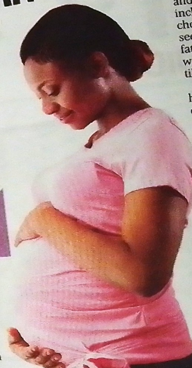
Expectant mothers are encouraged to get adequate rest to support better brain health

During pregnancy and after childbirth, mothers are encouraged to eat