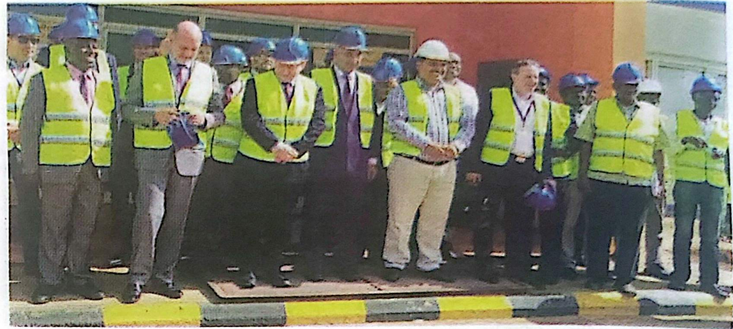
The UK delegation with employees of Roofings Group.

The delegation, together with the British High