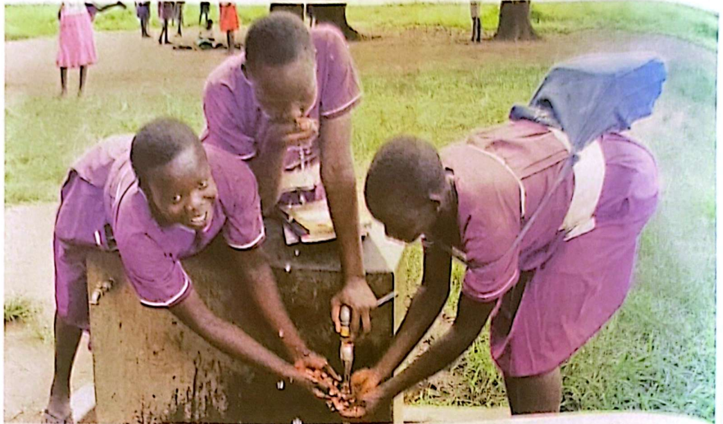
Pupils at Mungaya Primary School drink from a tap stand constructed by ADRA