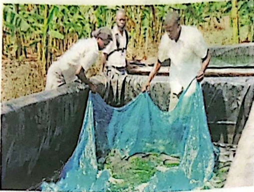
Fish has become one of Uganda's biggest export earners

CURRENTLY, THERE ARE OVER 18 SUGAR FACTORIES, WITH AN INSTALLED CAPACITY OF OVER 440,000 MILLION TONNES PER YEAR