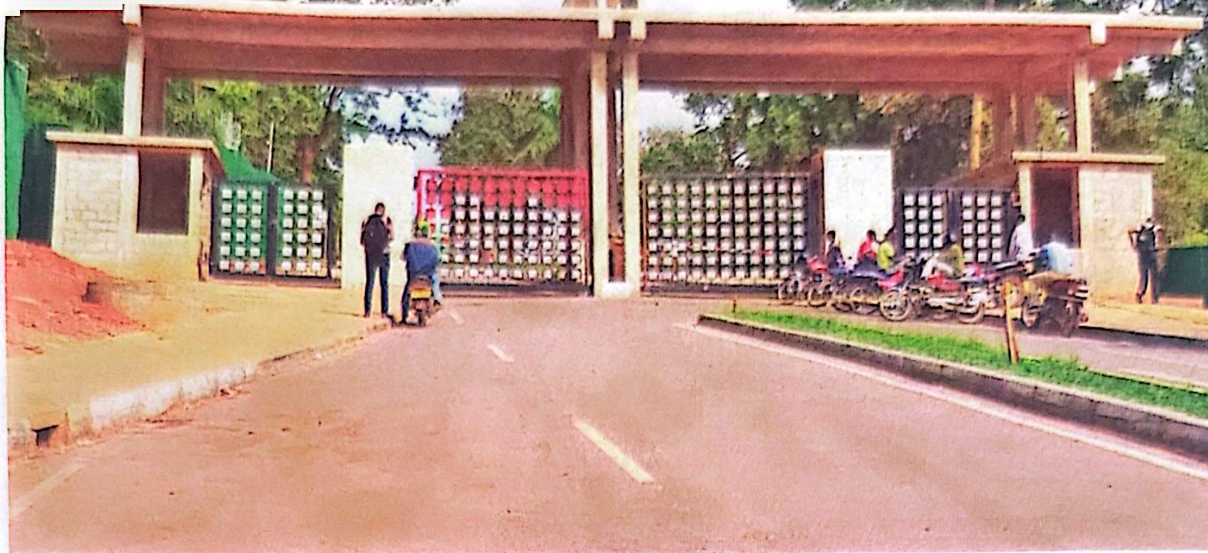
Pending. Makerere University main gate that is still under construction.