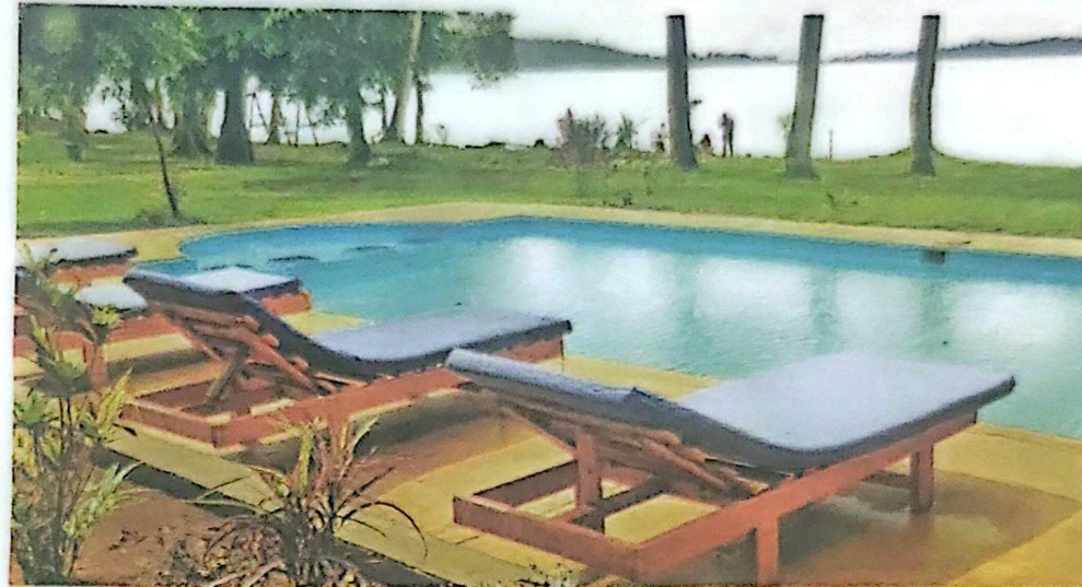
Guests can play on the beach and relax by the pool side

To cash in on growing opportunities available through tourism, several entrepreneurs have set up resorts and hotels, meaning you can spend as much