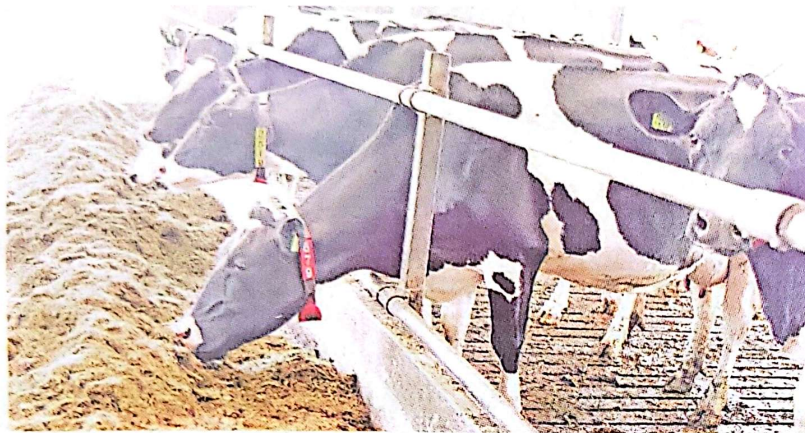
Livestock are as good as the quality of their feeds