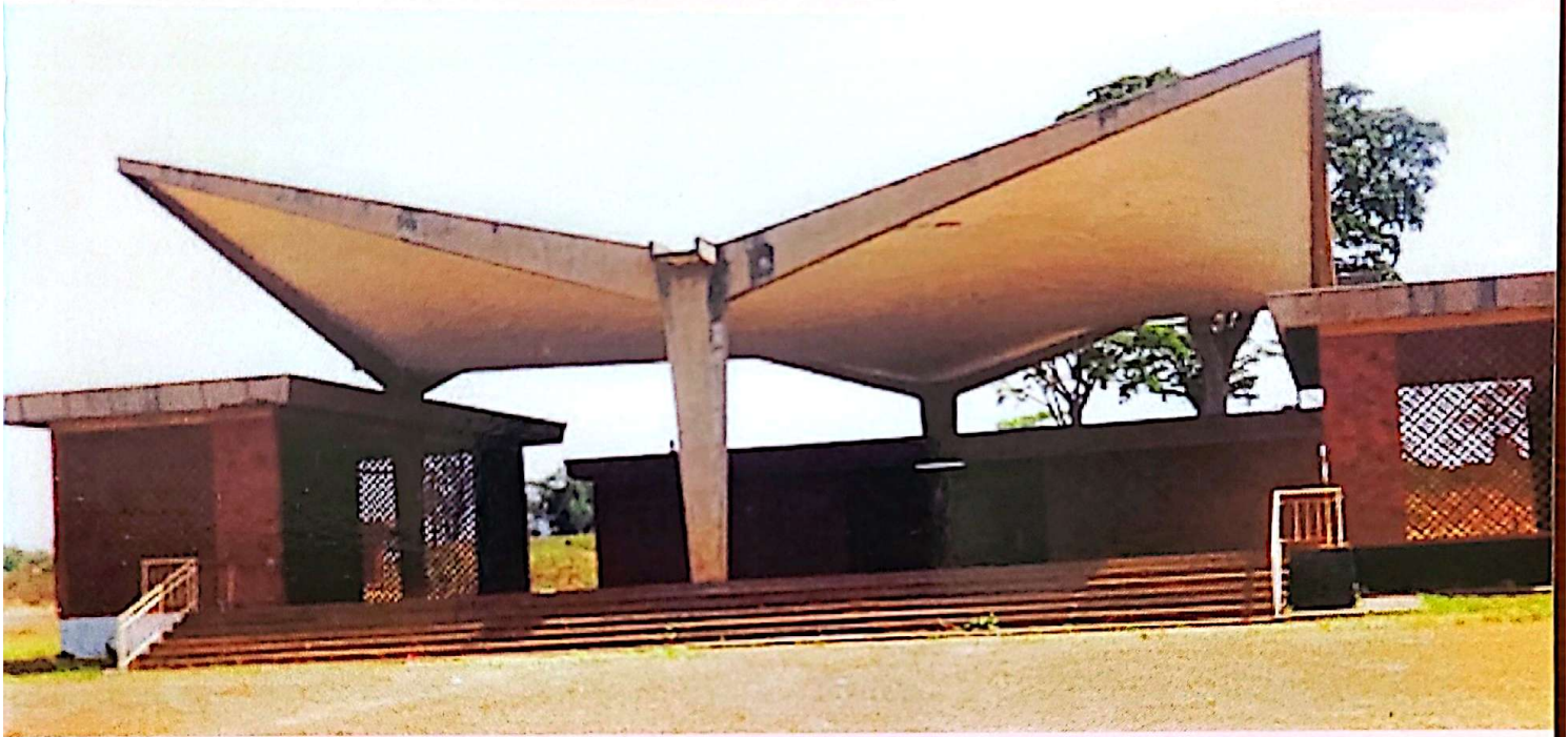
The Gymnasium at Busitema Campus