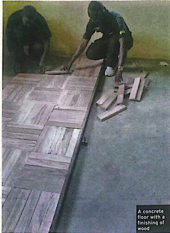
A concrete floor with a finishing of wood

Asaad Tamale, an interior designer, believes that wood floors are easy to maintain, durable and provide better air quality. "If wood floors get dirty or scratched, you