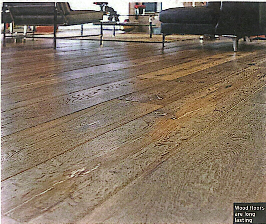
Wood floors are long lasting