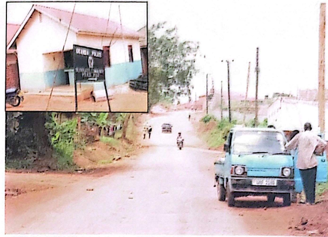
Buwaate Road, which is being constructed by the community. Inset is the Police station the community fundraised for and built.

A door-to-door campaign helped to raise some funds to build a police station, which was opened last year. Since