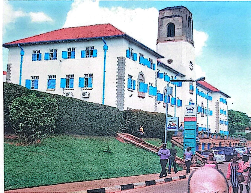
Makerere University's main building

Since the early 1990s, Makerere University has drifted from crisis to crisis, reportedly