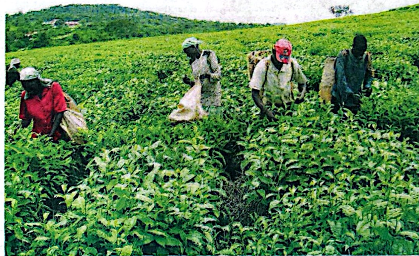
Farmers harvesting tea. The agricultural extension system in Uganda continues to be underfunded

registered complaints from farmers across the country about unwanted inputs that are given to them by the Operation Wealth Creation team.