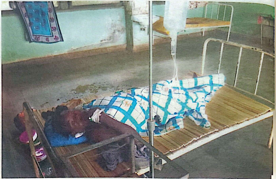
Derelict state. A patient, who is on drip, sleeps on a papyrus mat laid on a bed at Busolwe Hospital in Butaleja District last week.

"We wonder why our hospital has never received any major renovation since it was constructed. Government must take this as an emergency and rehabilitate the facility," she says.