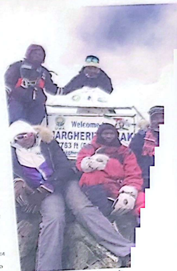
The team on the Margherita peak

At the end of six days, I was sure of this: an equivalent experience cannot be obtained elsewhere. Don't believe me? First go up, see for yourself and then dispute me.