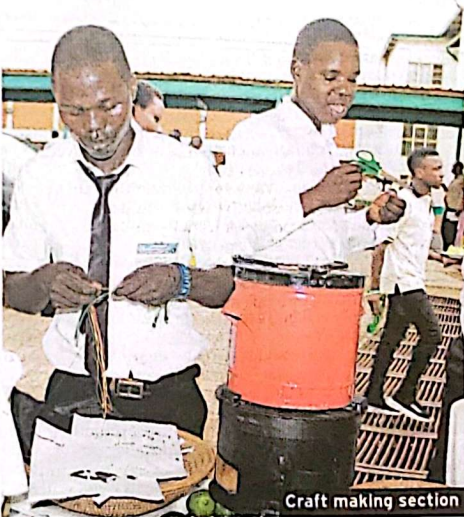
Craft making section