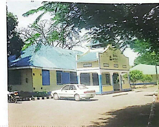
Busoga University, located in Iganga, was also accredited to teach law

ACCREDITATION OF UNIVERSITIES TEACHING LAW HAS HAD CHALLENGES SUCH AS UNIVERSITIES TEACHING THE DISCIPLINE AFTER BEING ACCREDITED BY NCHE, BUT BEFORE BEING GIVEN A GO-AHEAD BY THE LAW COUNCIL