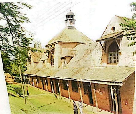
At UCU, one must sit and pass the pre-entry examination to qualify to study law

what law books are required, but the law council would look at that and recommend the basic textbooks," he notes.