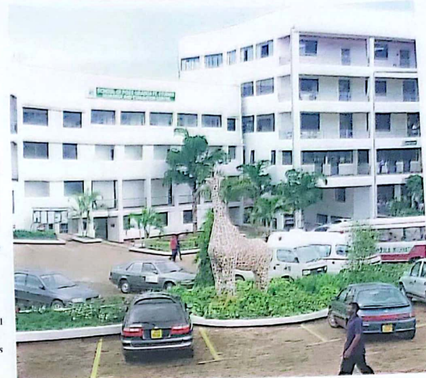
Kampala International University also teaches law

The law degree is a four-year programme offered in two semesters, each year culminating in a total of eight semesters over the full duration of the course. Students from accredited