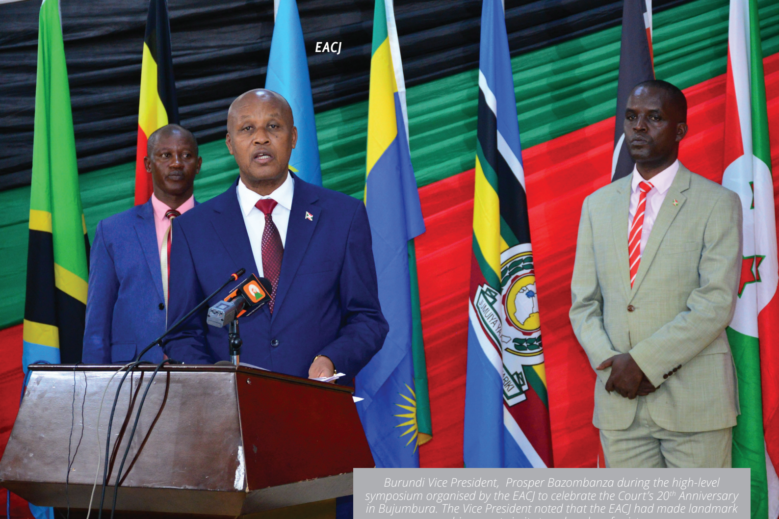
Burundi Vice President, Prosper Bazombanza during the high-level symposium organised by the EACJ to celebrate the Court's 20 th Anniversary in Bujumbura. The Vice President noted that the EACJ had made landmark achievements in its two decades of existence.