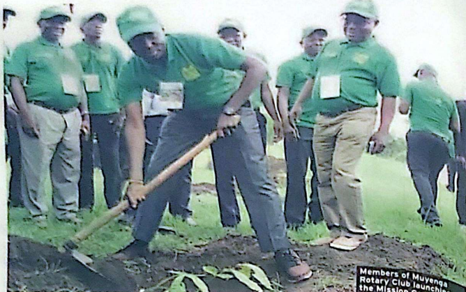
Members of Muyenga Rotary Club launching the Mission Green project