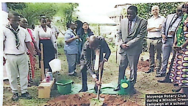
Muyenga Rotary Club during a Mission Green campaign at a school