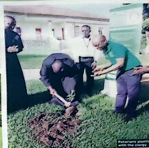
Rotarians planting trees with the clergy