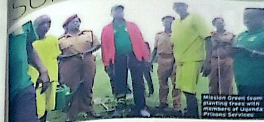
Mission Green team planting trees with members of Uganda Prisons Services