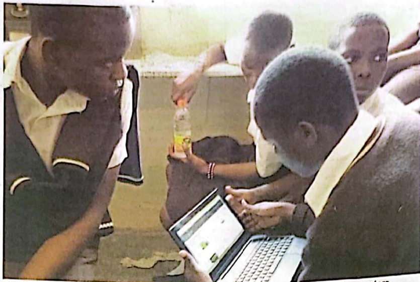
Students of Martin Luther King Secondary School in Kireka, Kampala trying out Yaaka tablet computers