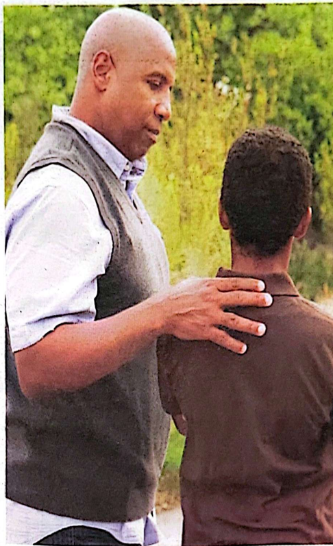
Parents need to revive their sexuality chats with their children.