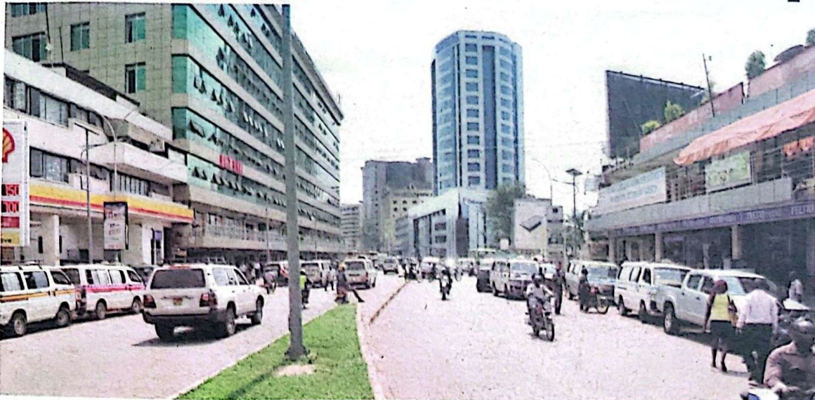
Development. A section of Kampala Road shows different modern buildings in the city.

Beauty. The physical appearance of the city has been transformed from bushes to lockup shops and finally to current storied buildings towering from different hills.