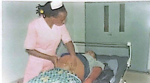
A midwife examining a mother in labour. Prolonged labour increases risk of fistula

Today Uganda joins the rest of the World to commemorate the International Fistula Day under theme: End fistula now, reach everyone . The commemoration aims at raising awareness, visibility of obstetric fistula and identify actions towards ending the condition in Uganda and world over. Agnes Kyotalengerire explores what the Government is doing to eliminate the backlog of 75,000 to 100,000 patients who are not treated.