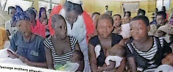
Teenage mothers attending post-natal clinic at Nabbi Hospital. Teen mothers are at high risk of fistula

"Their bones surrounding the birth canal are not fully developed so their baby may not be able to navigate through the canal," Olara explains. Poor nutrition during childhood can also cause stunted growth and increase a woman's risk of fistula.