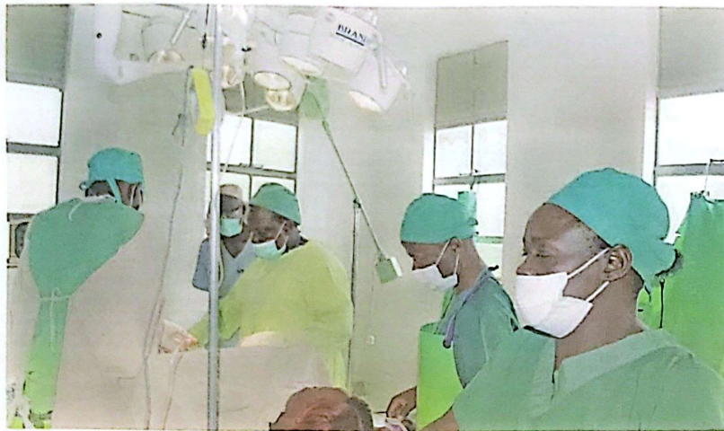
Doctors carrying out surgery during a recent fistula camp at Adjumani Hospital.

UNFPA reports indicate that every year, there are about 1,900 new cases