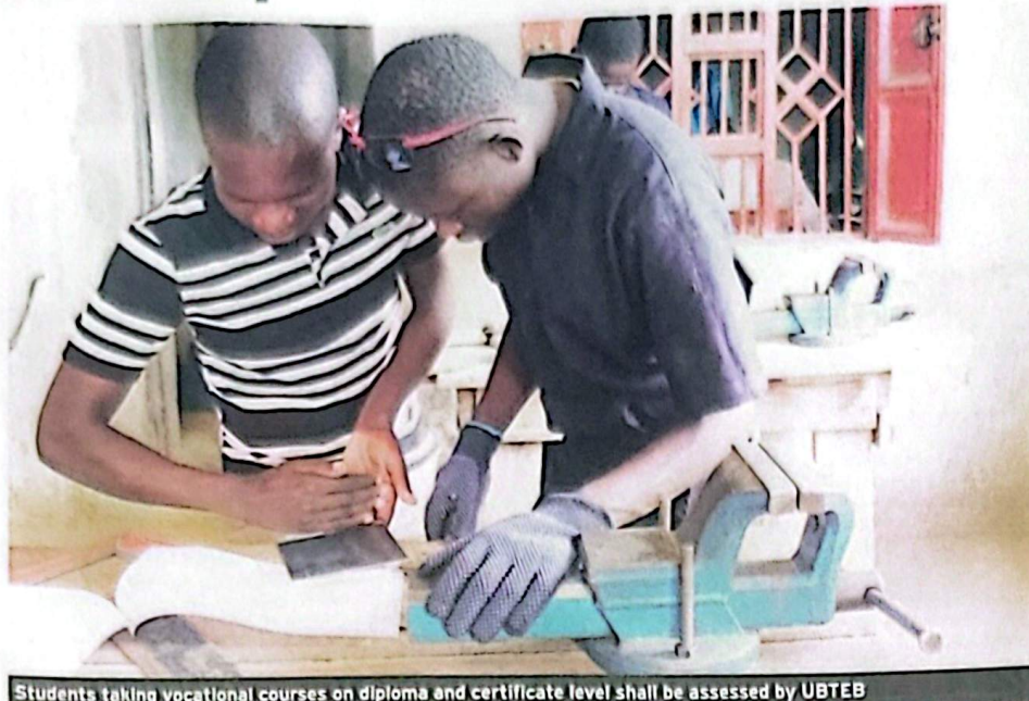
Students taking vocational courses on diploma and certificate level shall be assessed by UBTEB

The Solicitor General legal guidance implies that students in institutions which are