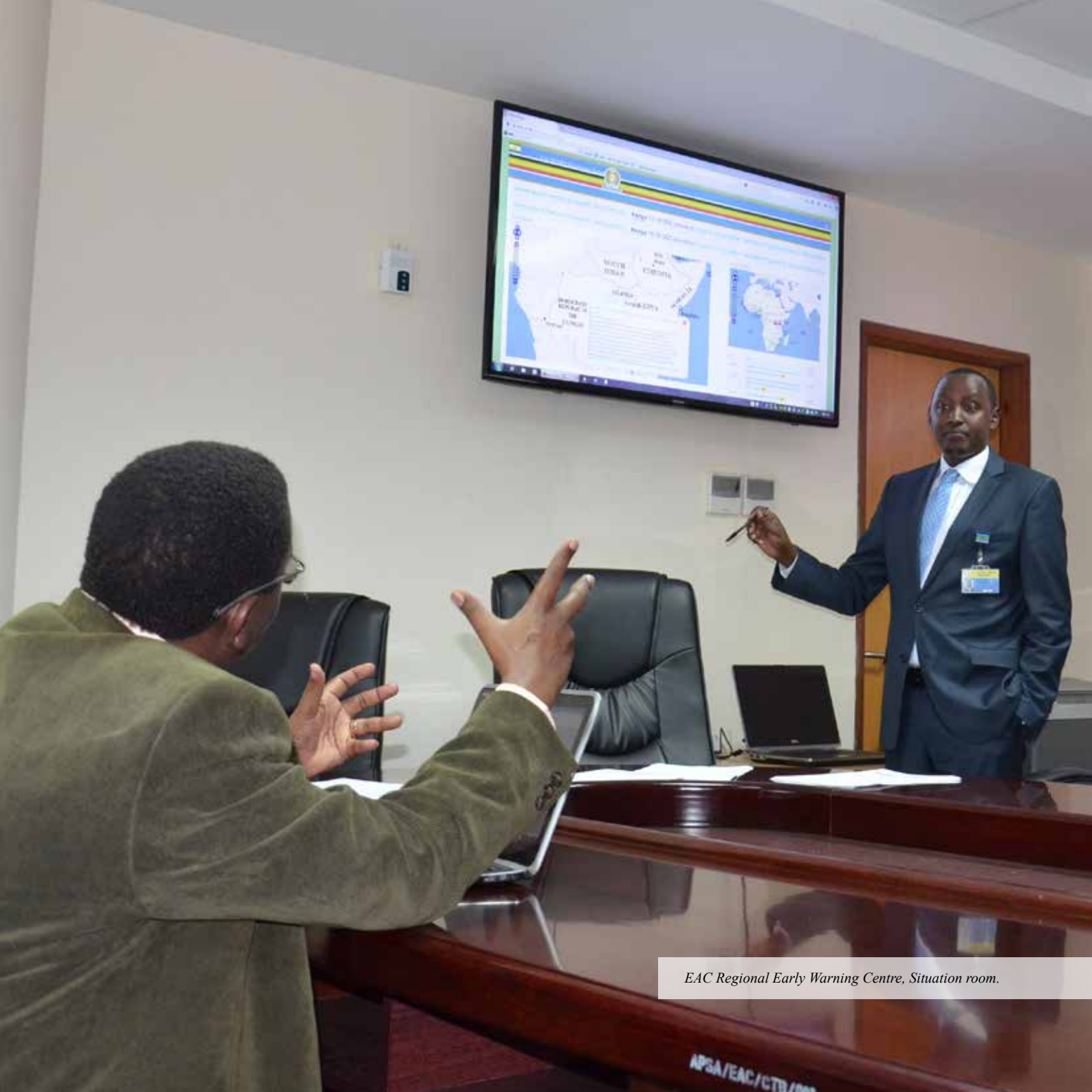
EAC Regional Early Warning Centre, Situation room.