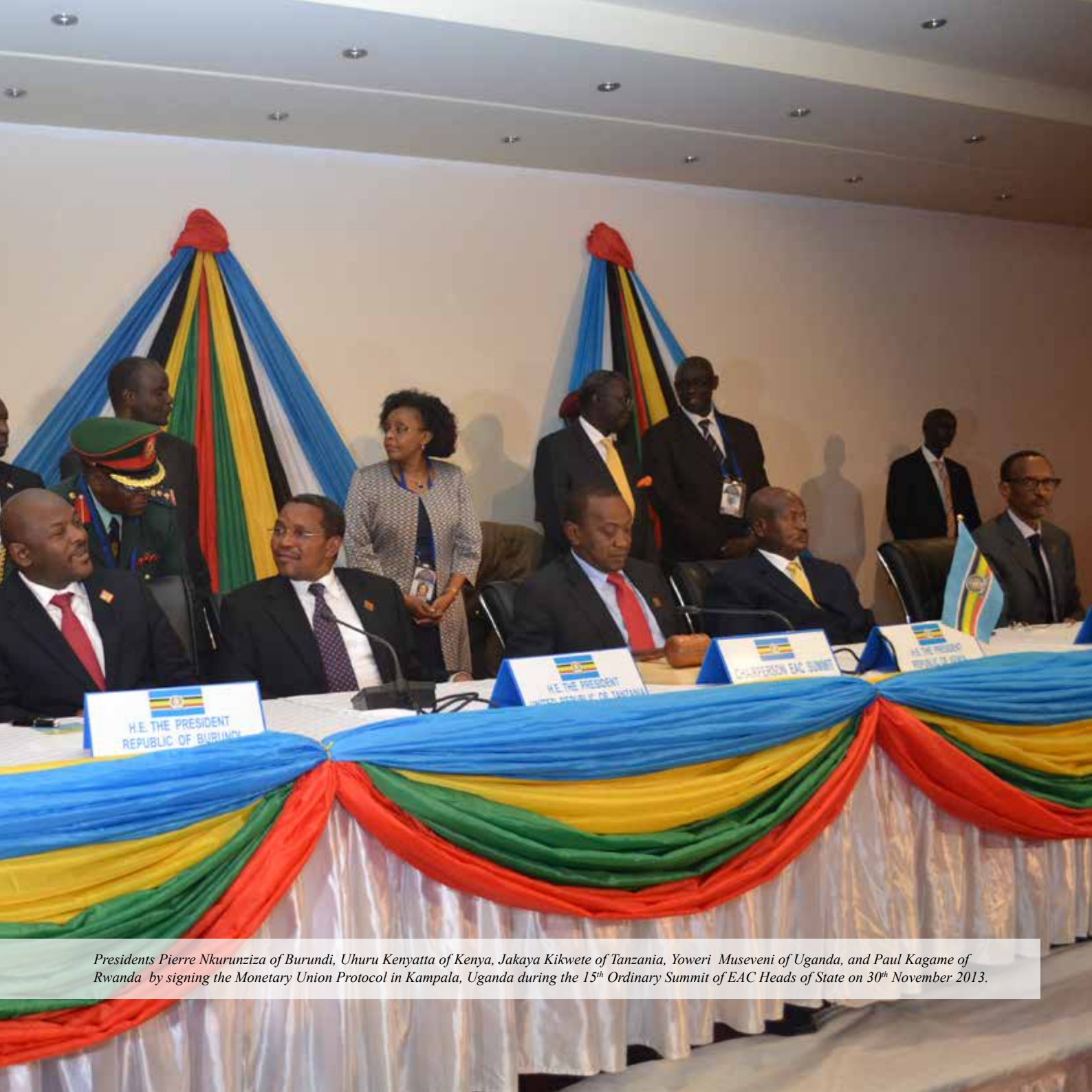
Presidents Pierre Nkurunziza of Burundi, Uhuru Kenyatta of Kenya, Jakaya Kikwete of Tanzania, Yoweri Museveni of Uganda, and Paul Kagame of Rwanda by signing the Monetary Union Protocol in Kampala, Uganda during the 15 th Ordinary Summit of EAC Heads of State on 30 th November 2013.