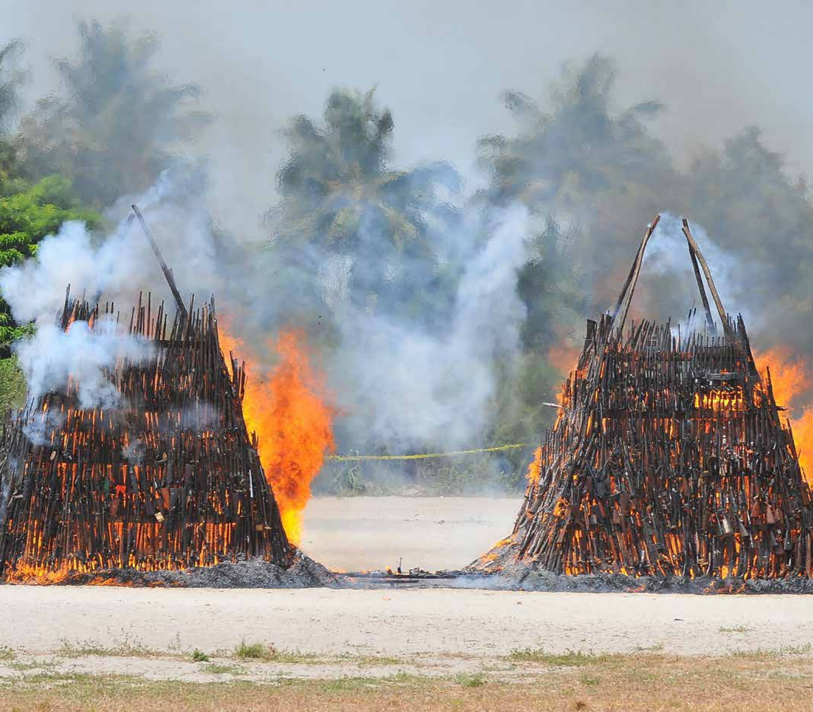
Small Arms Light Weapons (SALW) destruction at Ukonga Prison Grounds in Dar es Salaam, 16. February 2013.