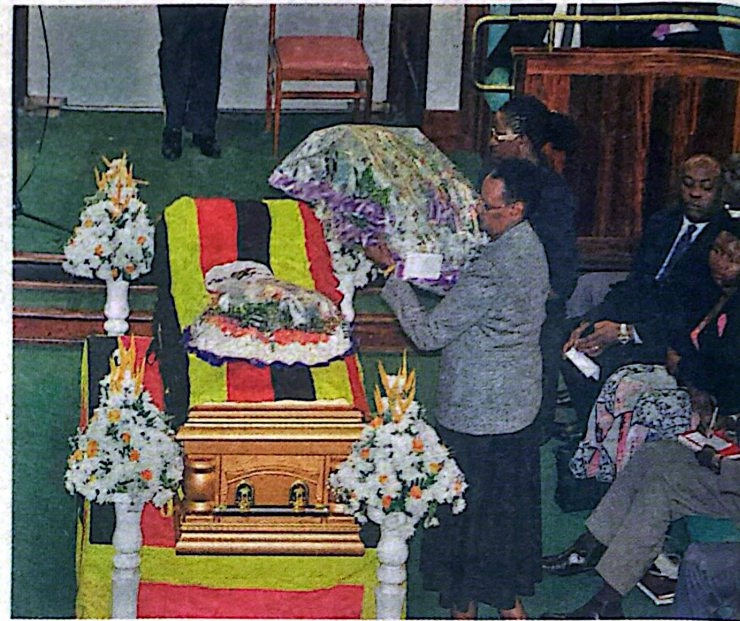
The First Lady laying a wreath on Zinkuratire's casket at Parliament