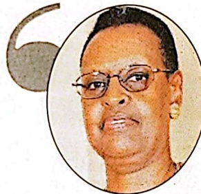
MRS JANET MUSEVENI, EDUCATION MINISTER

Within the next few months, all these classrooms will be furnished with good quality and modern furniture, which will make the teaching and learning environment more conducive for our children.