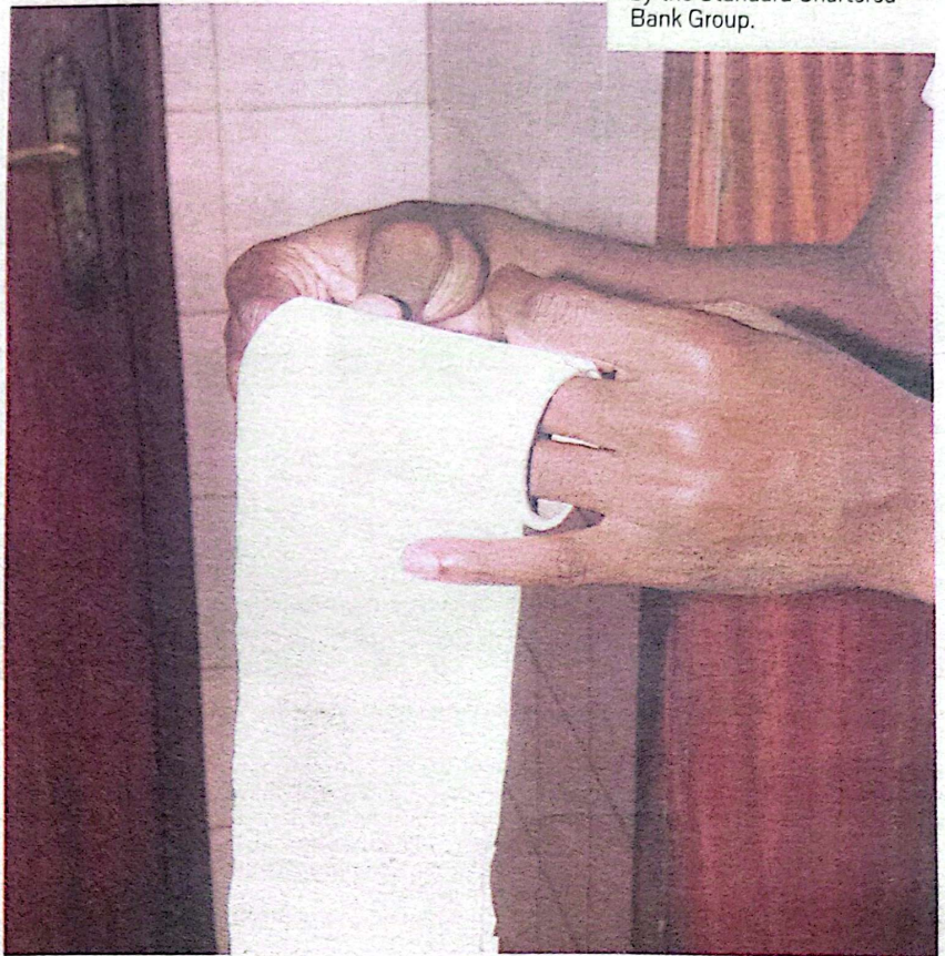
The sub-standard toilet papers, according to UNBS, expose consumers to diseases.