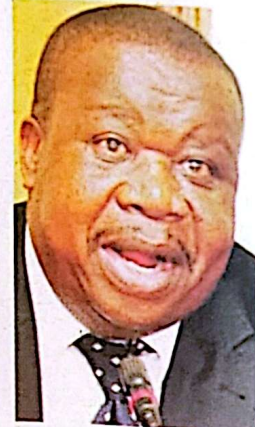
Gen Kahinda Otafiire