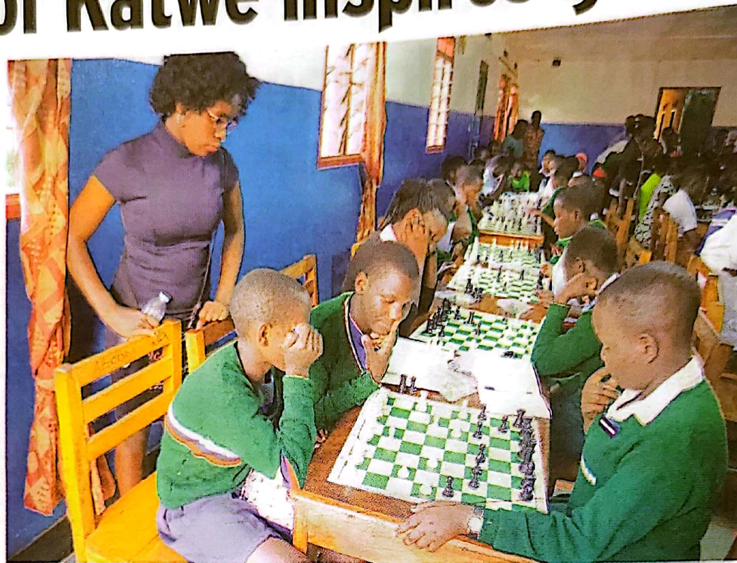
Mutesi watching girls playing chess at URDT in Kagadi.

Katende, told New Vision that they have decided to launch chess training in mid-western Uganda to help young people become critical thinkers using the skills gained in playing chess.