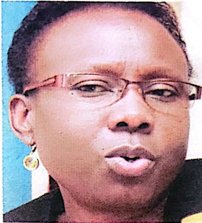
Dr Jane Ruth Aceng