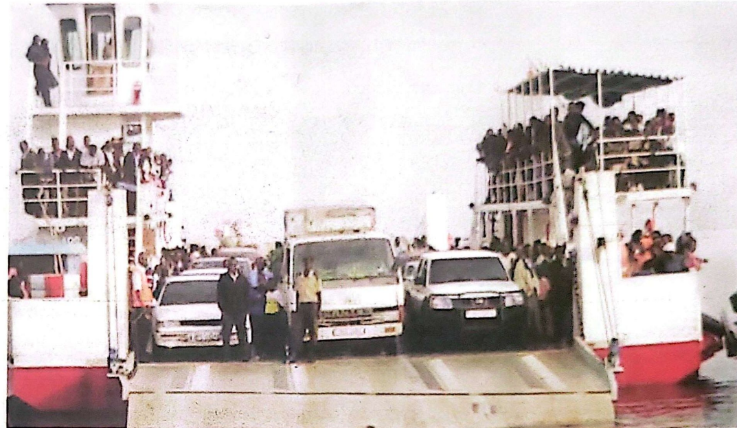
Means. MV Pearl, one of the three major marine vessels, operating on the island district.