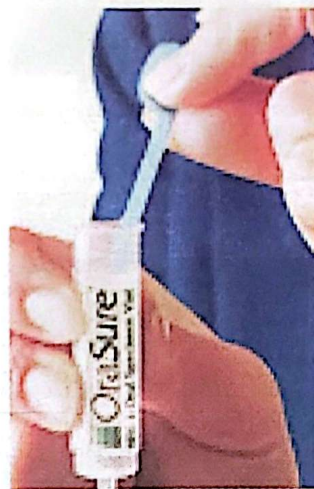
Step two. Insert the kit into the testing solution.