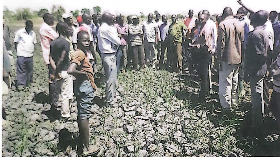
Those who planted rice beyond the buffer zone have been told not to bother weeding.

"I have 15 children with my two wives and we depend on growing rice for food, school