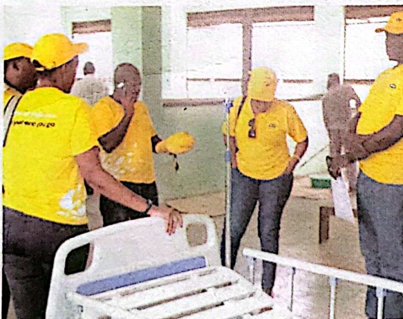
Reaching out. A team from MTN Uganda which donated beds, mattresses and mosquito nets at Busolwe Hospital yesterday.