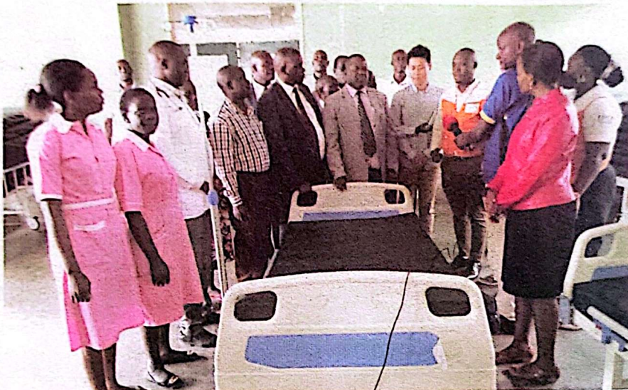
Donation. World Vision officials hand over mattresses, beds and incubators to Butaleja leaders at Busolwe Hospital on Wednesday.