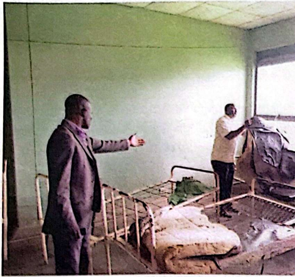
Before. Butaleja District officials inspect old beds and mattresses in one of the wards in Busolwe Hospital last month.

"We have also been getting a lot of premature babies, and we have been referring them to Mbale