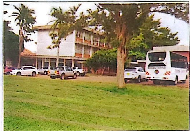
Busitema campus administration block

Technology and business innovation and incubation centre (TBIIIC) which focuses on innovation and product development and promotes commercialization of knowledge. The University also has plans to operationalizing of Busitema University holding company; Establish an Industrial park with the support of Uganda Investment Authority, Commercializing of Arapai campus Farm and putting up a regional science Park and Technology Incubation Centre with support of the National Council for Science and Technology. We also want to establish a textile production training unit with support of Government of Uganda and a nutrition, maternal