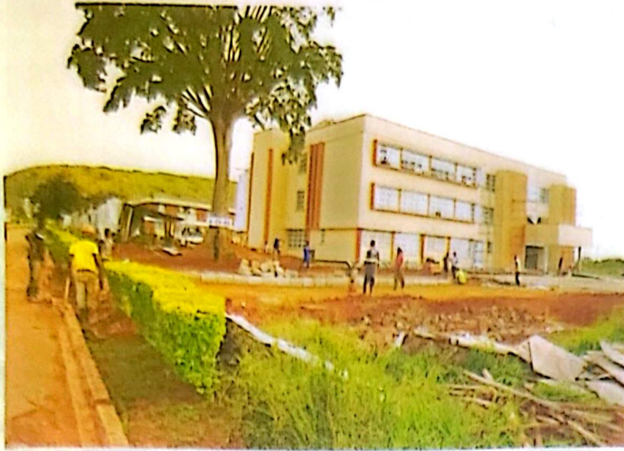
The University Lib. constructed under ADB project by PRISMA UG.Ltd

significance through embracing new, unique and relevant academic programs, equipping students with knowledge and appropriate skills, seeking partnership in order to have recognition nationally and internationally. And our focus is different from other public Universities because we focus on science and technology knowledge transfer through promoting practical sciences, relevant technology, productive education and innovation for sustainable development.