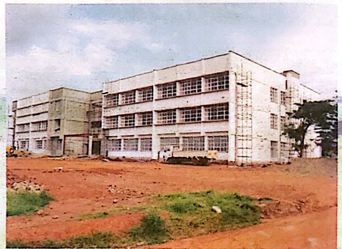
The ongoing construction of laboratory and lecture blocks for faculty of Engineering by PRISMA UG.Ltd

ANS: Of course, this University has positioned itself as one of the institutions with potential to assertively contribute to socio economic transformation and address problems of national, regional and global among which are, excellent