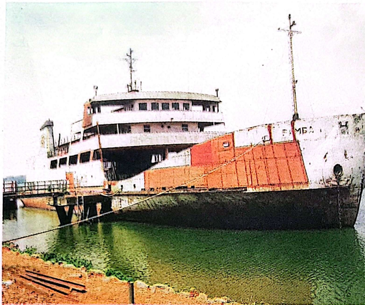
MV Pamba has been grounded awaiting repairs

in Uganda which is why they have to resort to Tanzania.