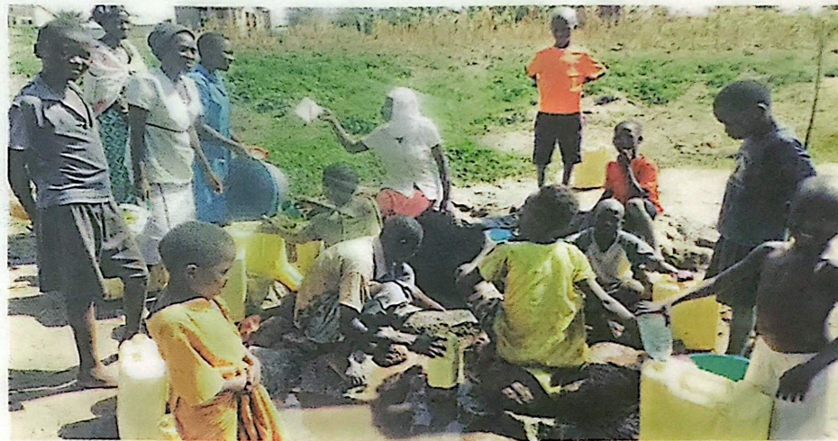
Kagwese residents draw water from an unprotected spring.

"We have a sh4.2b Butebo water project being undertaken by Gets Technical Ltd. It is connecting piped water to Kabwangasi,