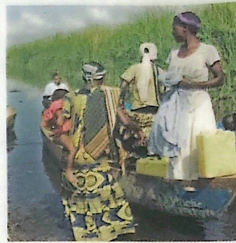
Women and children at Daraja landing site, Gogonyo sub-county on their return after fetching water on the lake